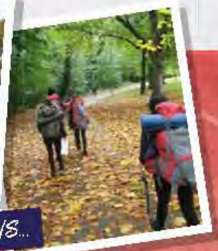
THE MARCH BEGINS...