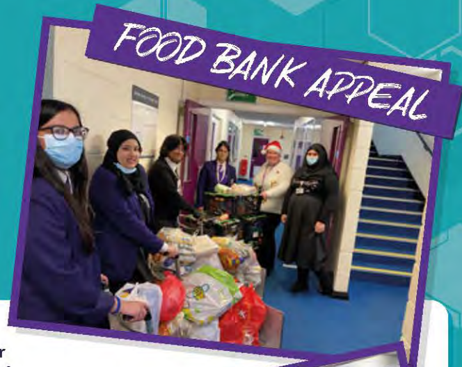
FOOD BANK APPEAL

For more information on the Manchester South Central Foodbank please visit their website: www.manchestersouthcentral.foodbank.org.uk