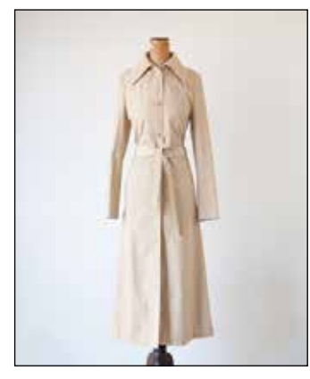
#2 TRENCH COAT

This cute fashionable sweater will have heads turning. It's warm, cute, lazy and easy to pair with. Nothing beats a comfortable easy look. It also comes with a jaw-dropping price meaning it's NOT for lazy Sundays.