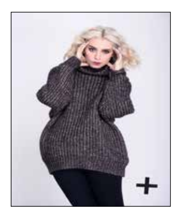
#4 OVERSIZED SWEATER

Dungarees are the cutest most adorable clothing ever. You can wear them with almost anything. Get a playful, adorable look within minutes.