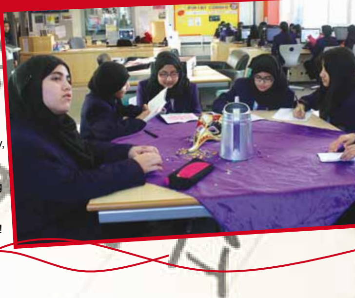
Creative Writing Club is on Wednesday lunchtimes in the LRC

Year 7 and 8 students are enjoying developing creative writing skills in the LRC on Wednesday lunchtimes. Students are examining diverse themes and topics for story writing and poetry. Additionally, students have, enthusiastically, entered two competitions. Power of Poetry has been very successful and 25 of our students have got through to the final stage of the competition. WICKED, the musical has attracted interest and students have been working really hard on their entries for the Young Writers Award. This prestigious award involves writing 750 words in story or poetic form. The students enjoy combining their imagination and ideas to create fantastic stories and poems!